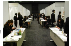
▲ Selection panel booths