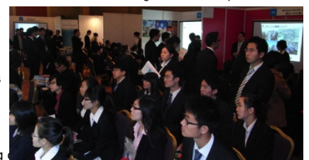
▼ Asian students listening to a recruiter’s presentation