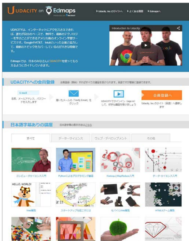
『UDACITY on Edmaps』 course List page